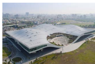
National Kaohsiung Centre for the Arts, Taiwan Size: 141,000 m 2 Year: 2007 - 2018