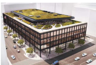
Martin Luther King Jr. Memorial Library, Washington D.C., US Size: 37,000 m 2 Year: 2014 - 2020