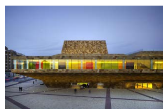
La Lotja Theatre and Conference Centre, Lleida, Spain Size: 37,500 m 2 Year: 2004 - 2010