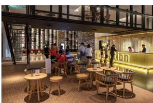
Hotel The Place, Tainan, Taiwan Size: 14,500 m 2 Year: 2011 - 2014