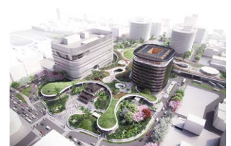
Kaohsiung Train Station, Kaohsiung City, Taiwan Size: 182,000 m 2 Year: 2014-2024