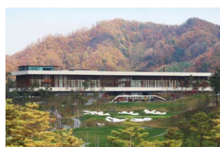
Whistling Rock Golf Clubhouse, Chuncheon, South Korea Size: 7,500 m 2 Year: 2007 - 2012