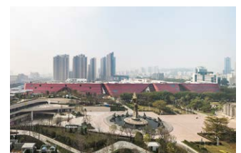
Longgang Cultural Centre, Shenzhen, China Size: 99,000 m 2 Year: 2012- 2019