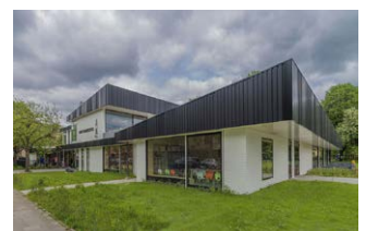
Anne Frank Primary School, Utrecht, NL