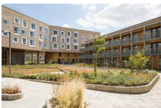
Key Worker Housing, University of Cambridge, UK