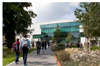
Fontys University of Applied Sciences, Eindhoven, NL