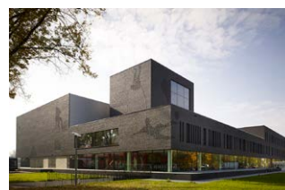
Fontys School of Sports Studies, Eindhoven, NL