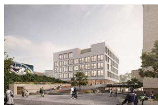
Stadskantoor en Raadhuis Heerlen, NL