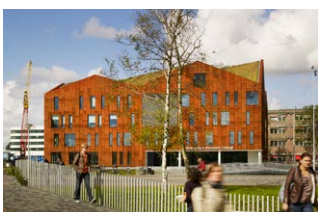
Amsterdam University College, NL