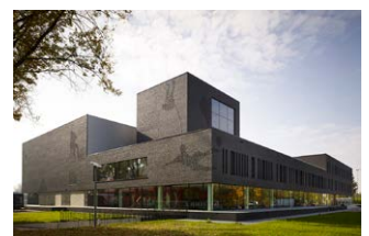
Fontys School of Sports Studies, Eindhoven, NL Size: 16,500 m 2 Year: 2009 - 2012