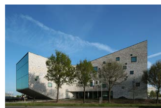
Rabobank Westelijke Mijnstreek Advice Centre, Sittard, NL Size: 6,800 m 2 Year: 2011 - 2014