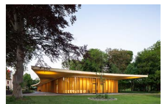
Pavilion Château St. Gerlach, Valkenburg aan de Geul, NL Size: 1,400 m 2 Year: 2014 - 2017