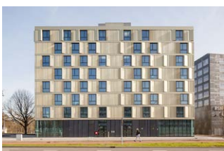
Erasmus Campus Student Housing, Rotterdam, NL Size: 9,500 m 2 Year: 2014 - 2018