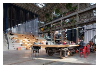
LocHal, Tilburg, NL Size: 7,000 m 2 Year: 2016 - 2018