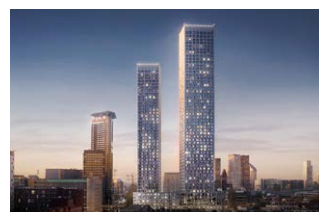
The Grace, The Hague, NL Size: 120,000 m 2 Year: 2018