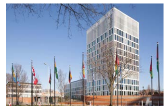
Eurojust, The Hague, NL Size: 18,475 m 2 Year: 2011 - 2017