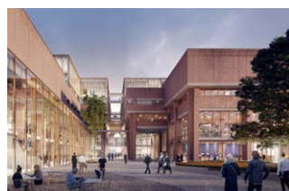
Generalsanierung Gasteig, München, Germany Size: 90,000 m 2 Year: 2018