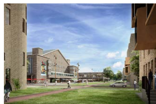
Food Centre, Amsterdam, NL Size: 56 ha Year: 2012 - 2022