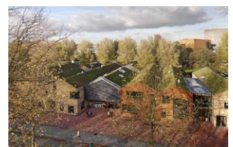
Kiem Special Care School, Dordrecht, NL Size: 5,300 m 2 Year: 2010 - 2013