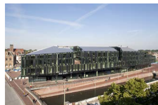
Municipal Offices and Train Station, Delft, NL Size: 28,320 m 2 Year: 2006 - 2017