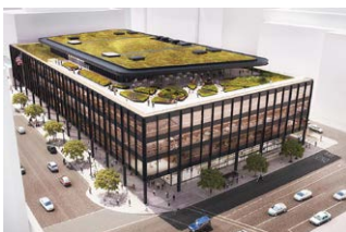
Martin Luther King Jr. Memorial Library, Washington D.C., US Size: 43,000 m 2 Year: 2014 - 2020