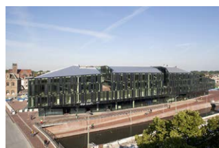
Municipal Offices and Train Station, Delft, NL Size: 28,320 m 2 Year: 2006 - 2017