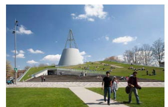
Delft University of Technology Library, NL Size: 15,000 m 2 Year: 1993 - 1998