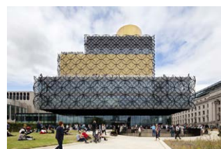
Library of Birmingham, UK Size: 35,000 m 2 Year: 2008 - 2013