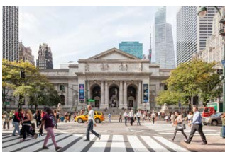
New York Public Library, US Size: 68,500 m 2 Year: 2015 - 2021