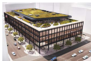
Martin Luther King Jr. Memorial Library, Washington D.C., US Size: 37,000 m 2 Year: 2014 - 2020