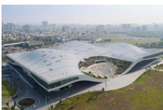
National Kaohsiung Centre for the Arts, Taiwan Size: 141,000 m 2 Year: 2007 - 2018