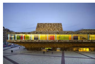
La Lotja Theatre and Conference Centre, Lleida, Spain Size: 37,500 m 2 Year: 2004 - 2010